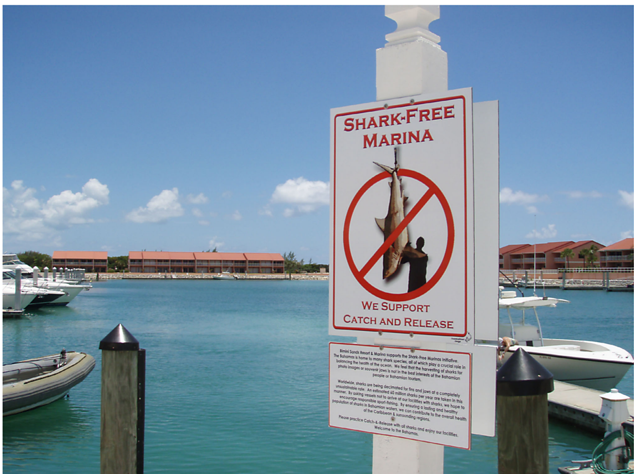
Fig. 2 Signage at a marina in the Bahamas depicting the ‘Shark-Free Marina’ initiative whereby marinas agree to prohibit the landing of recreationally caught sharks

A variety of techniques and gears are used in recreational shark fishing (Florida Museum of Natural History, Florida Sea Grant, NOAA Fisheries, Shiffman and Hammerschlag 2014; Gallagher et al. 2015; McClellan Press et al. 2015; Authors personal experience). For example, anglers targeting small sharks in nearshore tidal flats and reefs may use fly-rods or light tackle fishing from small skiffs, whereas trophy fishers may venture hundreds of kilometers offshore to target large pelagic sharks using heavy tackle in deep water and fishing from large charter boats (for more examples, see Fig. 1). Anglers also fish for sharks from shore (e.g., via surf casting), where sharks are usually brought on land prior to release. In the USA alone, more large sharks (i.e., non-dogfish) were landed by recreational anglers than commercial fishers in 2013 (Lowther and Liddel 2014; Shiffman 2014).