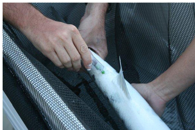
Fig. 1. Photograph of a blood sample being obtained from a great barracuda ( S. barracuda ) via caudal venipuncture using a 3 ml lithium heparin vacutainer and 3.8 cm (1.5") 21 gauge needle.

Ciguatoxin from tissue samples were extracted as previously described (Murata et al., 1990; Lewis et al., 1991; Bottein Dechraoui et al., 2005) with some modifications. Tissues were minced and extracted in acetone (3 ml/g of tissue) by homogenization, probe sonication on ice (1 min), and centrifugation for 5 min at 3000\times g . Supernatants were collected and pellets were again extracted by vortex mixing for 30 s, sonication for 1 min and centrifugation as described above. Both supernatants were combined in glass test tubes and dried under nitrogen flux at 50^{\circ}\text{C} . The dried residue was dissolved in 3 ml of 90% aqueous methanol by sonicating and vortex mixing and the aqueous methanol was extracted twice with 3 ml n-hexane by vortex mixing and phase separation by